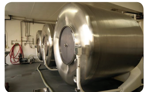
The butter churns at Stirling.

The churning process has been used to produce fine butters since time immemorial. Today though, the 'continuous process' method of making butter is most common. We at Stirling however, take an uncommon approach – we barrel churn our butter to deliver uncompromising taste, texture and performance. In this case, the difference really is in the details. Barrel churning produces a butter that is not 'overworked'. This ensures a wonderful traditional flavour, great 'mouth feel' and unparalleled cooking and baking performance! 🍞