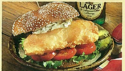
4 oz. portions are ideal for sandwiches or lunch entrées

CONTACT YOUR ICELANDIC® SALES REPRESENTATIVE ABOUT YUENGLING® LAGER HADDOCK TODAY!