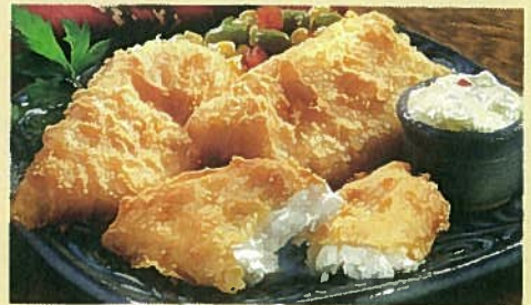
2 oz. portions offer a variety of menu options