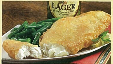
6 oz. and 8 oz. portions are perfect for platters