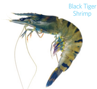
Black Tiger Shrimp