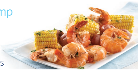
Quick and Easy Shrimp Boil