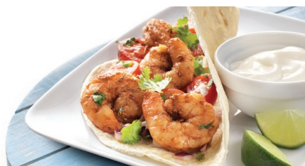
Chipotle Shrimp Taco