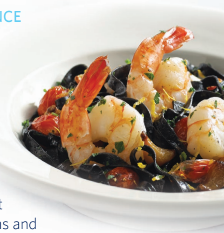
Black Tiger Shrimp with Black Ink Pasta

Mirabel is dedicated to working with the Best Aquaculture Practices (BAP) program and our Shrimp are sourced from BAP certified plants. We have developed state-of-the-art quality assurance programs and testing procedures. We have representatives on site in China, Thailand, Vietnam and India to ensure adherence to our strict specifications. And, we're working hard to purchase 100% of our seafood from sustainable or responsible sources.