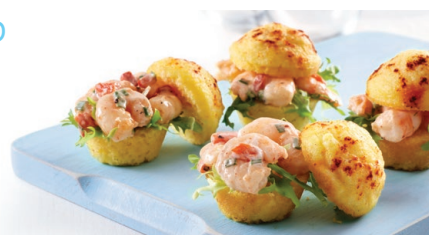
Mini Corn Muffins with Cajun Shrimp Salad